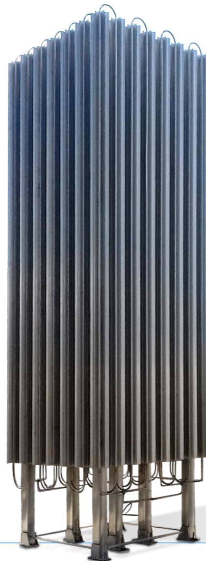
High Pressure Vaporizer