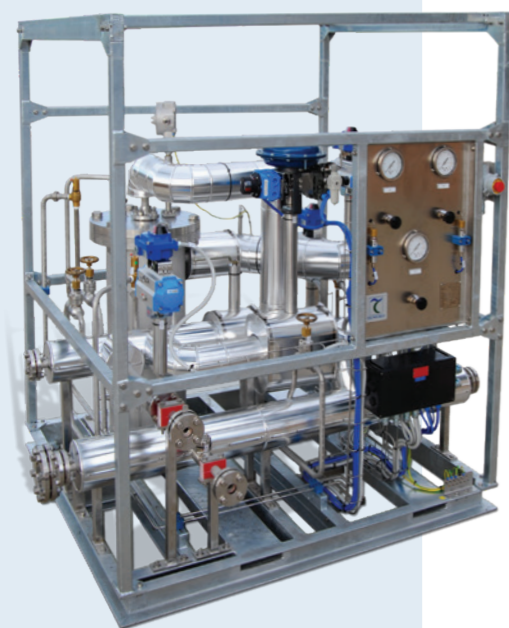
Cryogenic Submerged Pump Skid Subtran 15